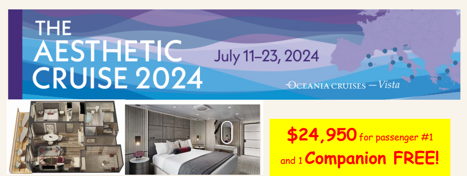
OCEANIA SUITE SUITE SIZE (SQ FT / SQ M): 1,000-1,200 / 89-109